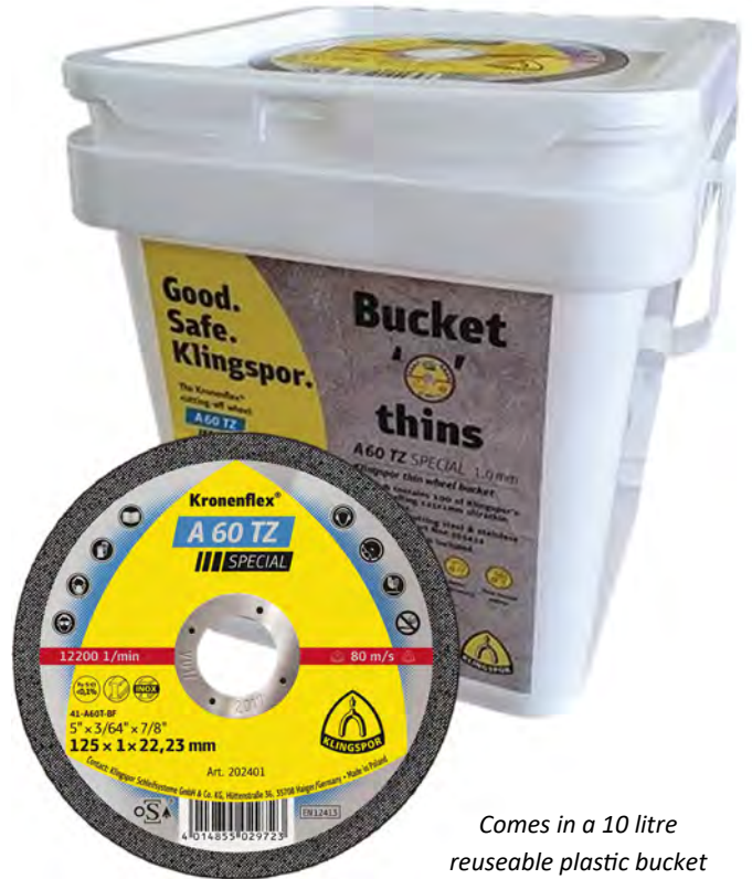
Comes in a 10 litre reusable plastic bucket

Unbeatable value for Klingspor Cut Off Wheels