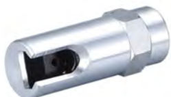
90° Push on Couplers