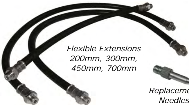
Flexible Extensions 200mm, 300mm, 450mm, 700mm