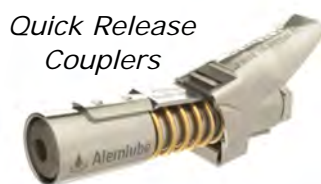
Quick Release Couplers