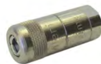
4 Jaw Couplers