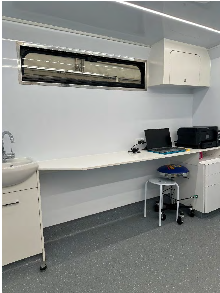
Testing Room 2